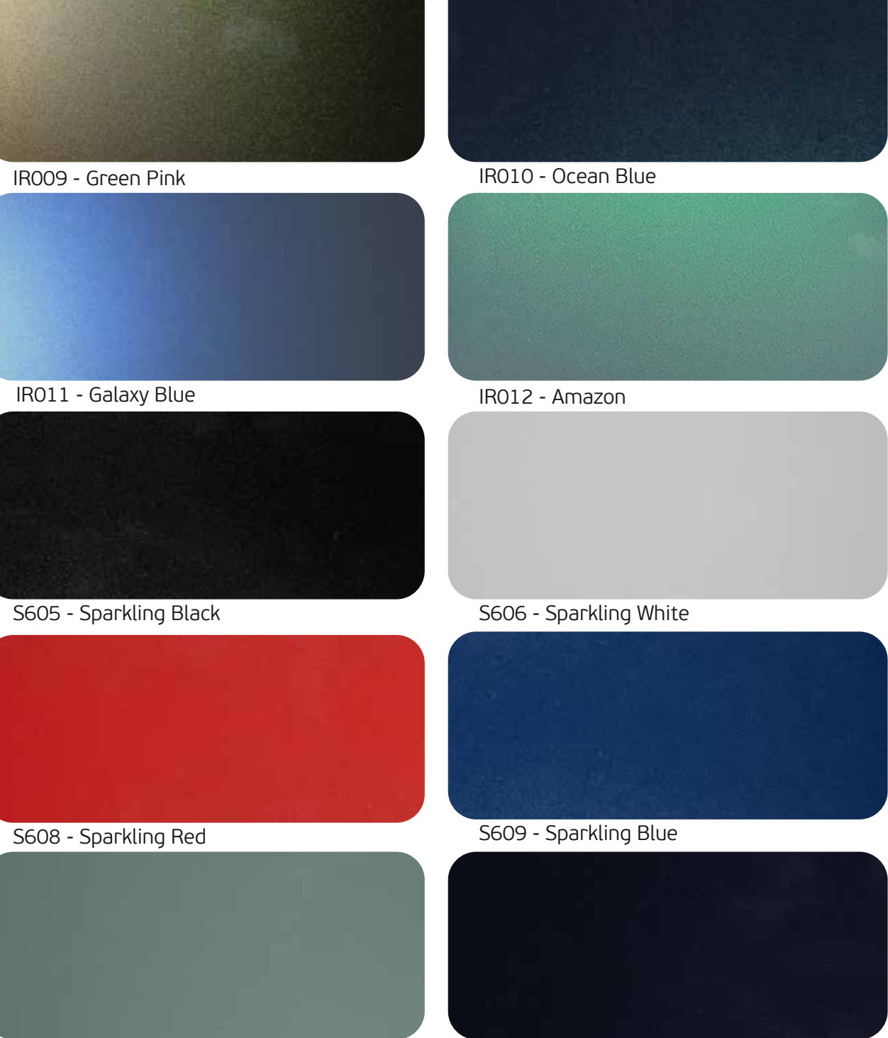
S610 - Sparkling Green