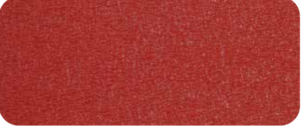
T014 - Wrinkle Terracota