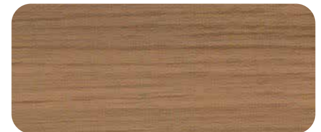
W212 - 1214 - Sunset Teak