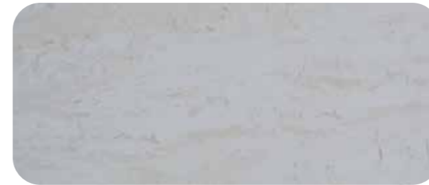
SL008 - Carrara 1