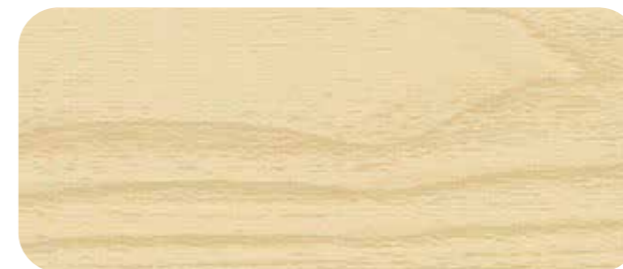
W208 - 1214 - Ahorn