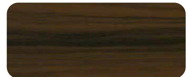
W218 - 1214 - Ebony