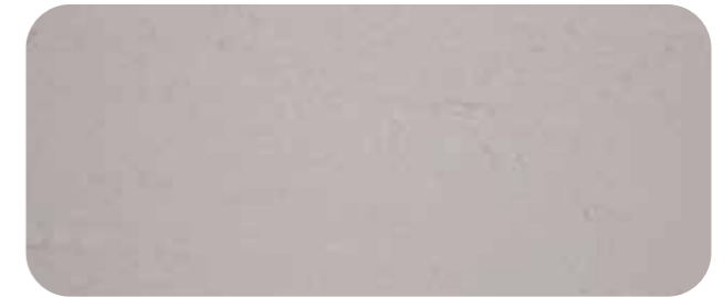
SL007 - Calacatta 1