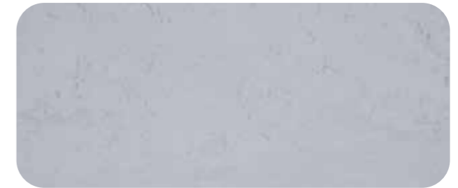
SL009 - Carrara 3