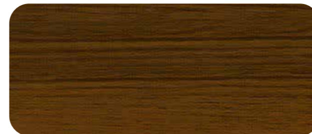
W202 - Teak Light