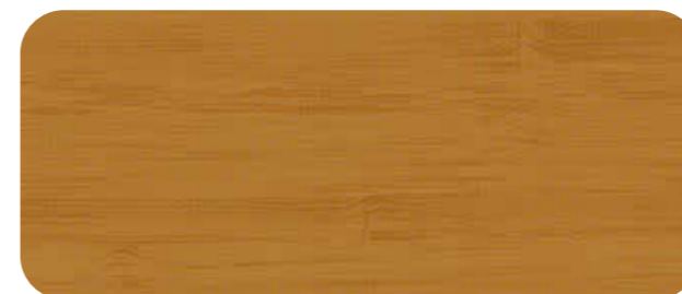
W215 - 1214 - Bamboo Light