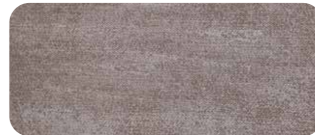
DL002 - Denim Beige