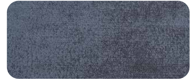
DL001 - Denim Blue