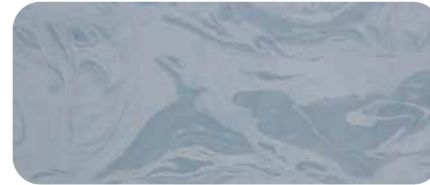
QL003 - Aqua Blue