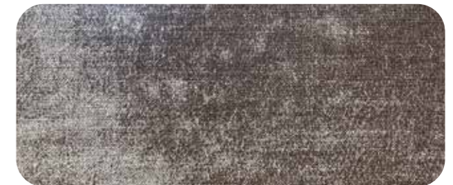
DL003 - Denim Beige Catalog