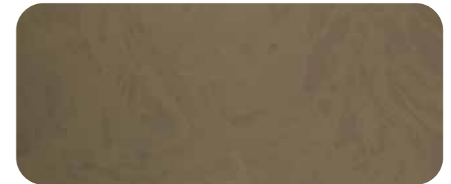
QL002 - Aqua Gold