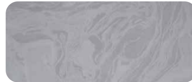
QL001 - Aqua Grey